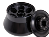
VF 6.94 BIOC

8 x 50 mL conical tube rotor with BioSafe Lid Max speed: 15,032 x g (11,360 rpm)