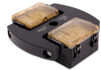
VS 2.5-96 BIOC

4 x 25 x 10 mL hexagonal bucket rotor Max speed 240V / 120V: 4,478 x g (4,700 rpm) / 3,748 x g (4,300 rpm)