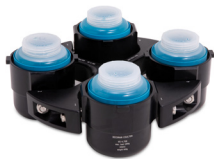
VS 4.750 BIOC

4 x 750 mL Swinging-Bucket Rotor with several configurations. Easily exchange buckets for microplate carriers or hexagonal carriers.