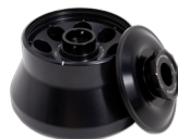
VFC 8.50 BIOC

24 x 15 mL conical tubes Max speed: 11,431 x g (9,000 rpm)