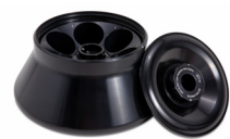
VF 6.250 BIOC

6 x 94 mL tube rotor with Biosafe lid Max speed: 11,872 x g (10,000 rpm)